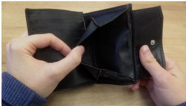
Can is skint.