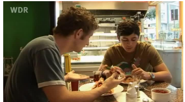
Can needs some money.