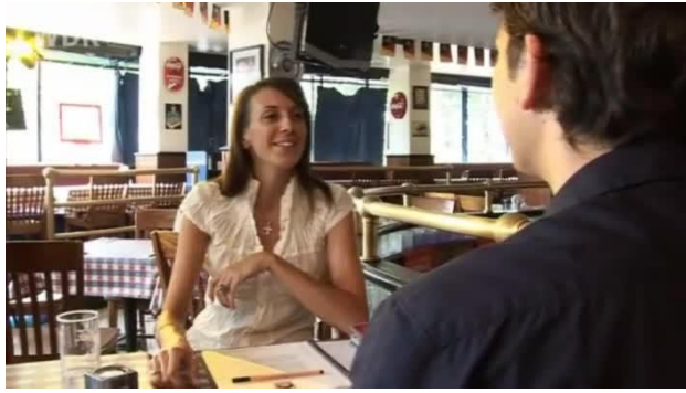
Can applies for a job.