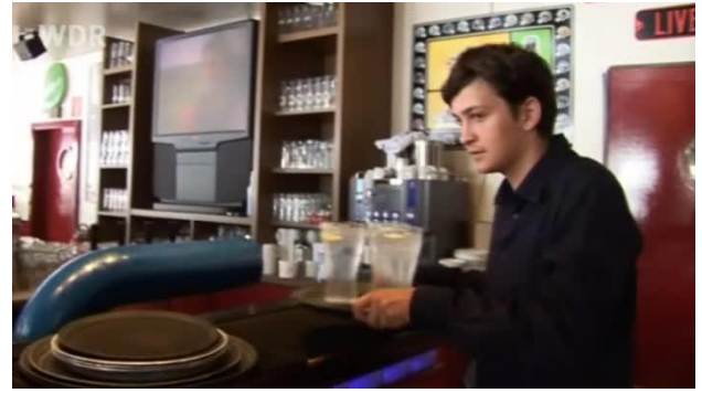
Can works as a waiter in a restaurant.