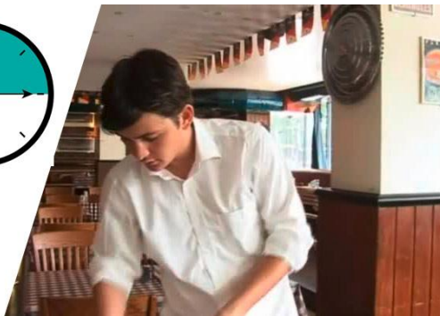
Can wants a part-time job.